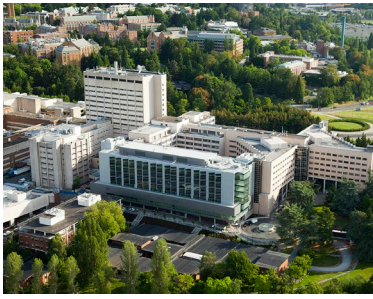
UWMC - Montlake campus is east of Interstate 5 and north of State Route 520.