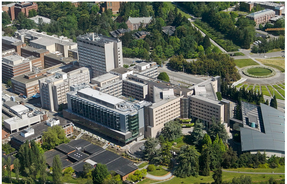
UW Medical Center - Montlake campus in Seattle, Washington