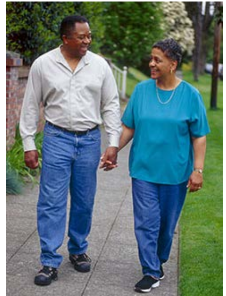
Recovery takes time. Be sure to resume activity slowly.