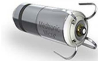
A tiny lithium battery is inside your leadless pacemaker.