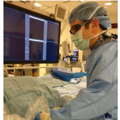
Your surgeon will use ultrasound to help place the catheter.

For your procedure, a long plastic tube ( catheter ) was inserted through an artery in either your groin ( femoral entry ) or your wrist ( radial entry ). Your surgeon has decided which entry point is safest for you.