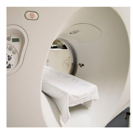
During your CT scan, you will lie on a table inside the CT machine.

During the scan, you will lie inside the CT machine. Many X-ray beams will be passed through your body as the X-ray tube revolves around you.