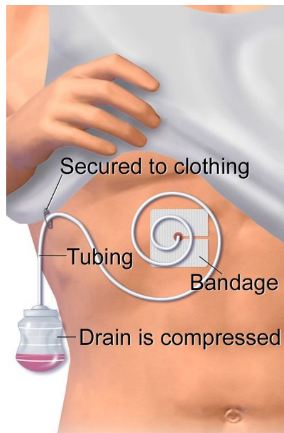
A Jackson-Pratt drain

Drawing used with permission from Truven Health Analytics.