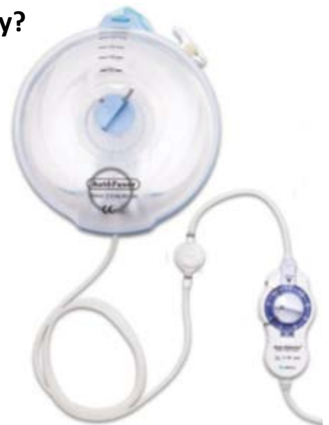
Autofuser Disposable Pain Pump