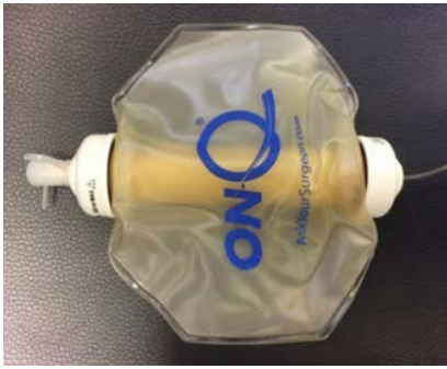
The pump when it is empty.