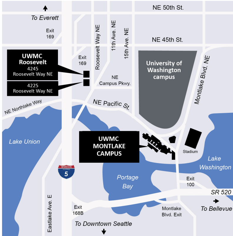
Locations of UWMC - Montlake and UWMC Roosevelt Clinics.