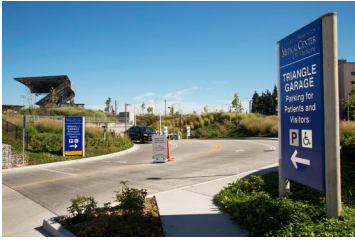
Entrance to the Triangle Parking Garage.