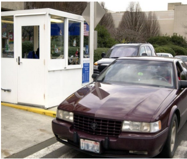
Valet parking at the main hospital is available weekdays, 8 a.m. to 5 p.m.