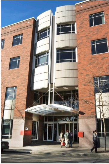
Entrance to one of the UWMC - Roosevelt clinic buildings.