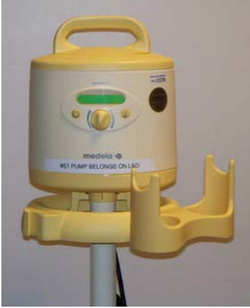
A breast pump