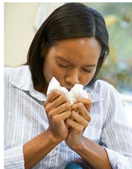
Human parainfluenza viruses can cause the common cold.