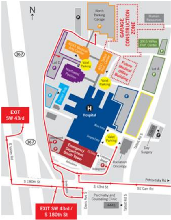
Area map for Valley Medical Center