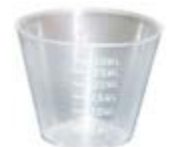
1-ounce medicine cup