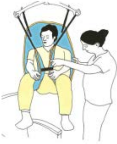
Nurse using a ceiling lift with a seated sling to move a patient to a chair.