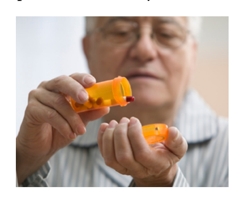
As a transplant recipient, you will take medicines to suppress your immune system, to keep it from rejecting your new lung(s).