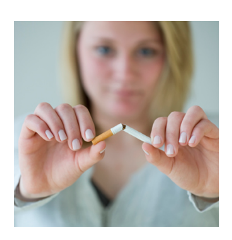
It is vital that you do not smoke, and that no one who is around you smokes.