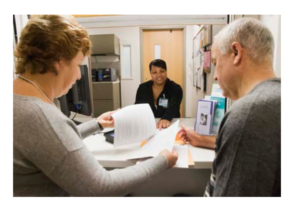
The Lung Transplant Social Worker is here to support you, your family, and your care providers.

The Lung Transplant Social Worker is a vital member of the UW Medicine Lung Transplant Team. The social worker can help you, your family, and your care providers cope with stress and resolve many of the issues that arise during the transplant process.