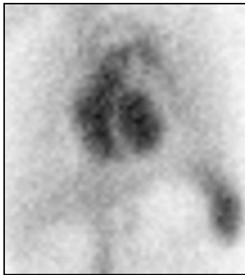
An image from a MUGA scan