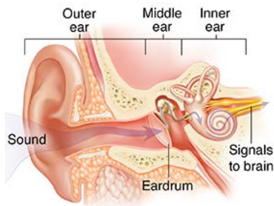
The eardrum is in the middle ear.