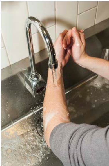
Everyone who visits the NICU must wash their hands and arms up to the elbows before they enter the unit.