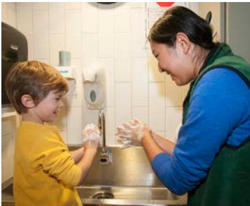
An adult must supervise children at all times when they are in the hospital.