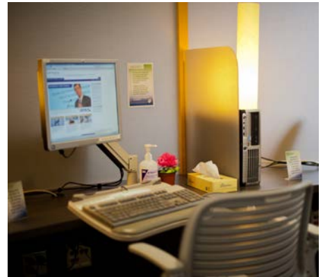
The Health Information Resource Center is on the 3rd floor of the hospital, next to the Gift Shop.

Thank you for working with us to create a safe, healing, and positive environment in the NICU!