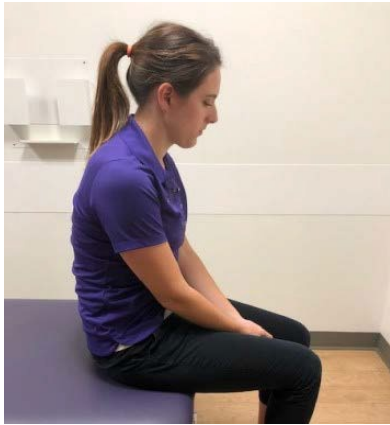
Sitting like this will increase your lower back pain.