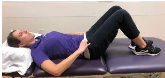
Gently pull your muscles in as you breathe out in this exercise.