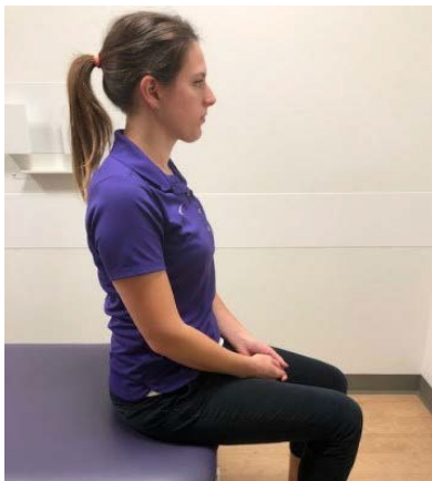
Sitting like this may help ease your lower back pain.