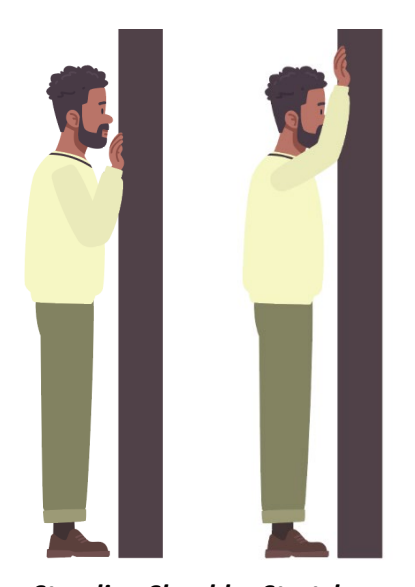
Standing Shoulder Stretch