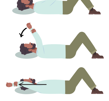
Lying-Down Shoulder Stretch

It may take a few days until you can raise your arms to shoulder height. Set movement goals with your surgeon or PT/OT.