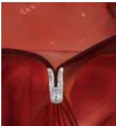
The MitraClip in place