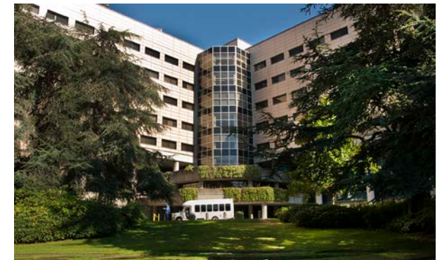
University of Washington Medical Center

This booklet provides information about our ICUs. We hope it will answer most of your questions about these units. Please talk with a staff member if we can help in any way.