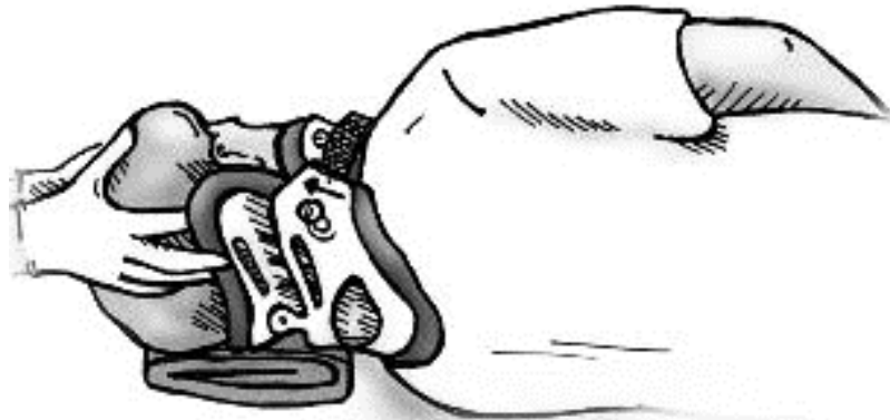
Check the back of the patient's head for redness or irritation.